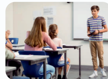
Social Skills Development