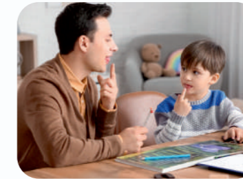
Speech and Occupational Therapy