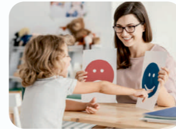
ABA (Applied Behavior Analysis) Therapy

We use a combination of treatment programs to help individuals communicate, develop life skills, and manage emotions. These programs support greater independence and confidence.