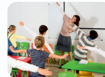
Life Skills Training